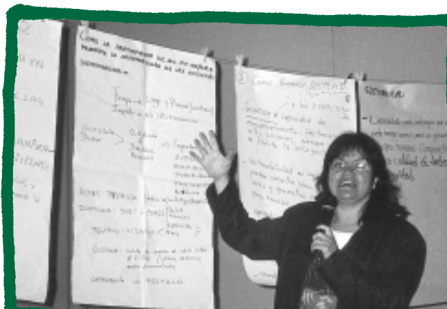
A participant in Ecuador sharing the results of a participatory activity and explaining how the results will be used in their future work

As people become more experienced with the approach, they take increasing responsibility for planning their own learning sessions. They learn how to work together in a group. They also gain experience in using the activities and visual tools to do their own fieldwork.