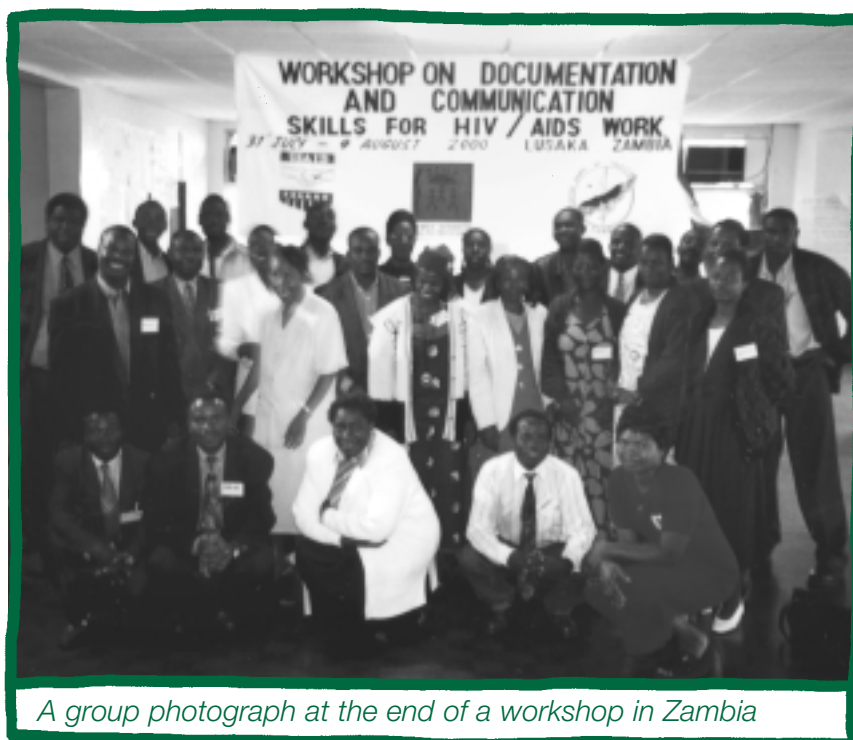
A group photograph at the end of a workshop in Zambia