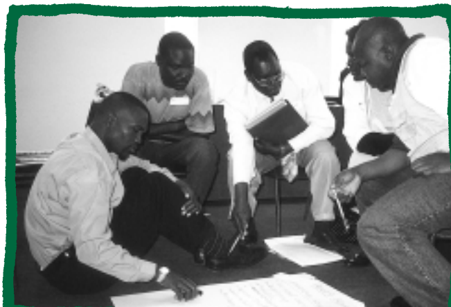
Participants at a workshop in Zambia sharing and discussing experiences openly in group work

Participatory learning also ultimately provides people with a framework of skills that they can use in any situation to explore issues and take action.