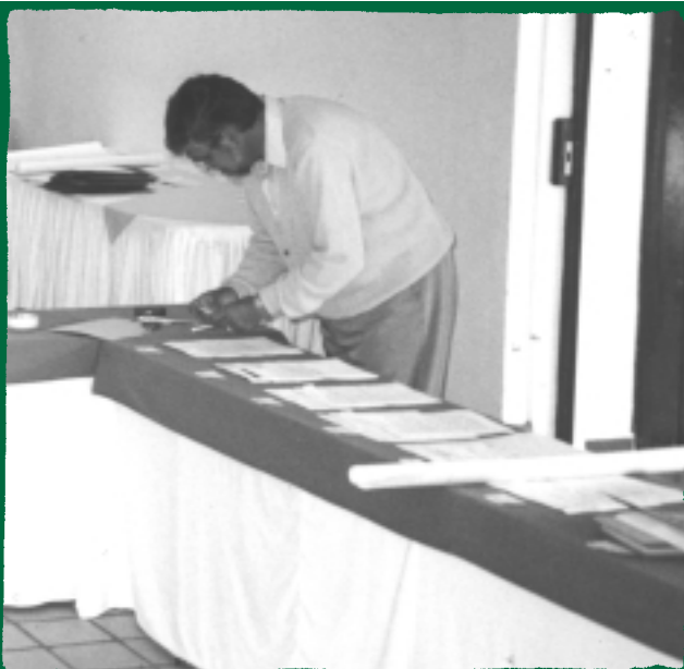
A facilitator preparing materials for a session at a workshop in Mexico