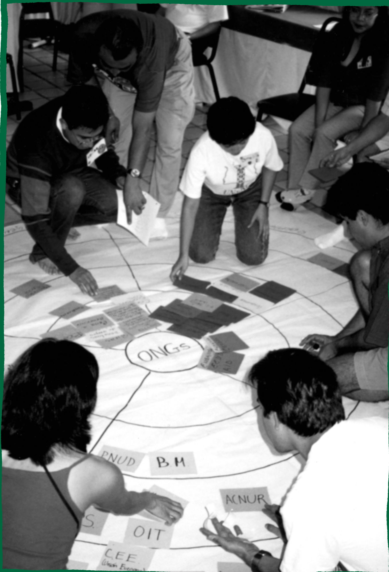
Participants at a resource mobilisation workshop in Mexico identifying potential sources of support