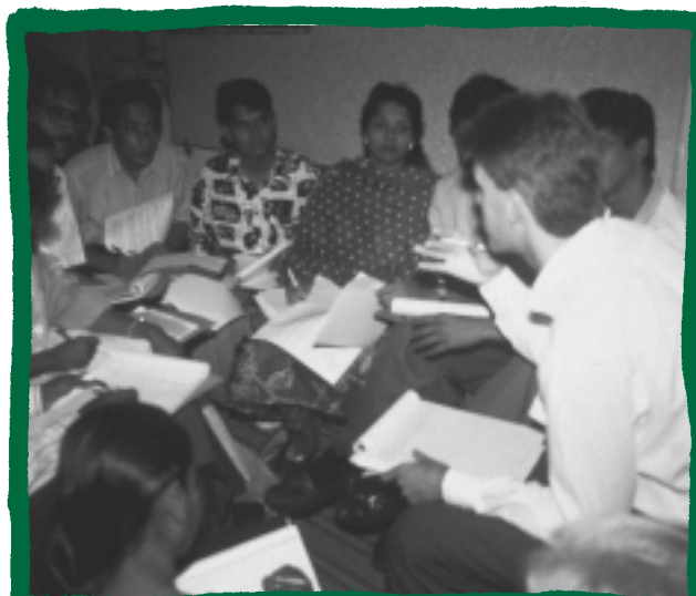
A facilitator at a workshop in Bangladesh helps the group to explore their ideas

Facilitators do not have to have all of these characteristics. However, they should aim to have at least some from each area and to be open to developing more as they gain experience.