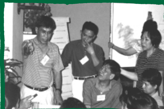
A good group dynamic encourages these participants from the Philippines to stay interested in their activity

Balance participation. Encourage quiet participants to speak and dominant ones to respect others.