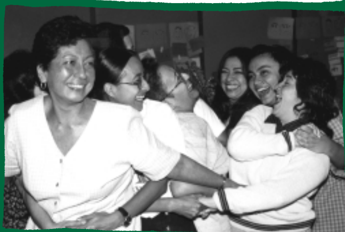
Participants at a workshop in Mexico showing that games such as "knotty problem", can be both fun and thought provoking

When people look sleepy or tired, "energisers" can be used to get people moving and to give them more enthusiasm.