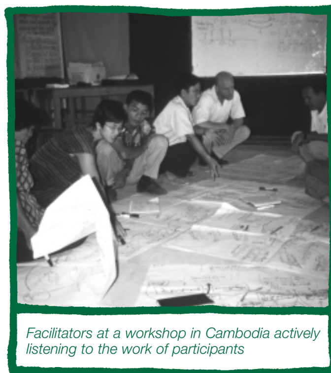
Facilitators at a workshop in Cambodia actively listening to the work of participants