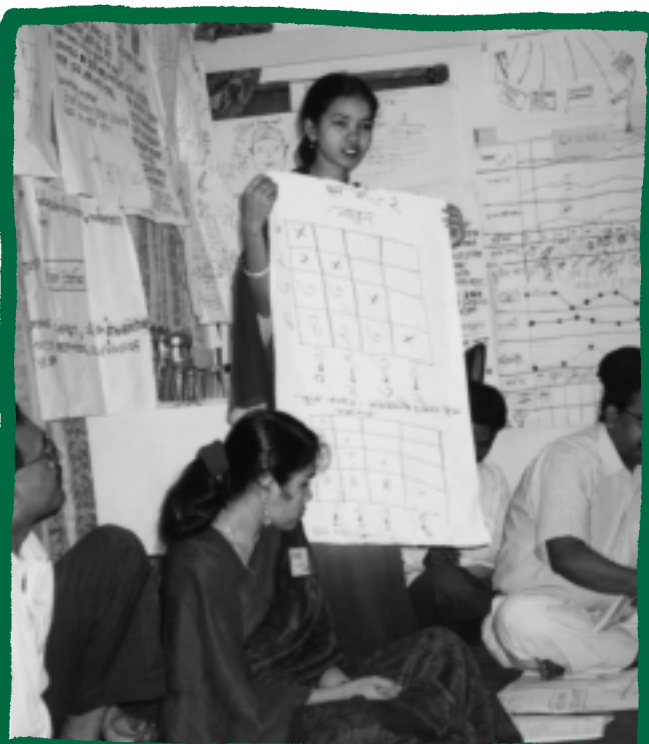
A participant at a participatory review workshop in Bangladesh shows the results of a ranking exercise

Participatory approaches to learning are active approaches that encourage people to think for themselves. Participants actively contribute to teaching and learning, rather than passively receiving information from outside experts, who may not have local understanding of the issues. The approach encourages people to share information, learn from each other, and work together to solve common problems.