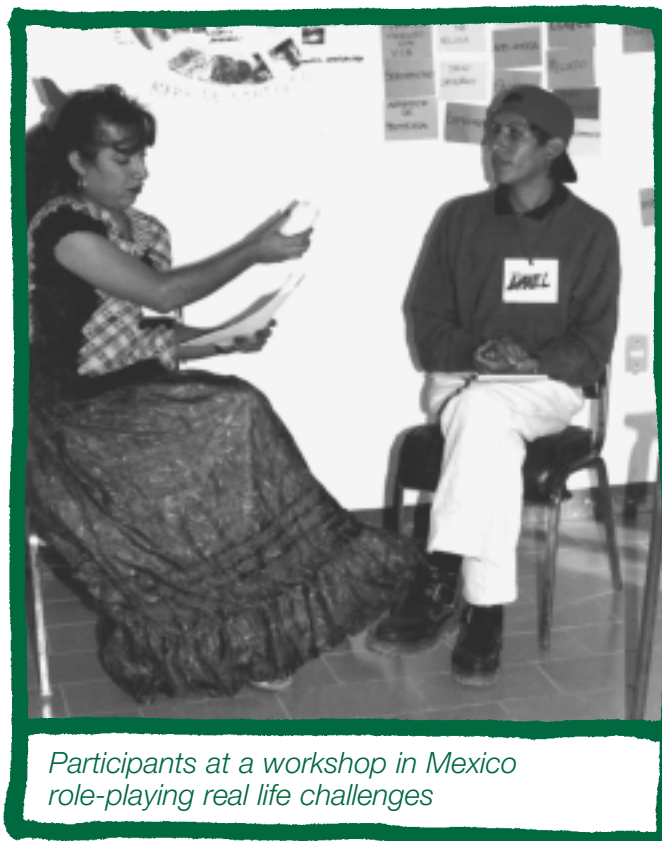
Participants at a workshop in Mexico role-playing real life challenges

Facilitators ensure that everyone gets an equal opportunity to participate. Through active listening and good questioning, they demonstrate that each person’s contribution is valuable. Facilitators help group members to develop communication skills by promoting discussion. Activities such as role play and case studies are used to explore different points of view.