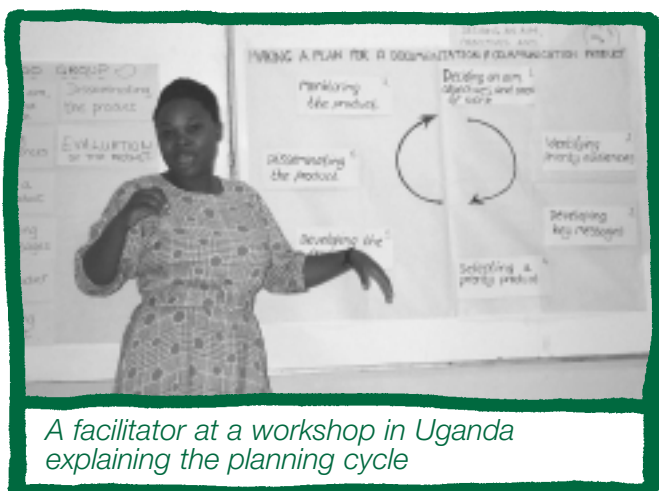
A facilitator at a workshop in Uganda explaining the planning cycle