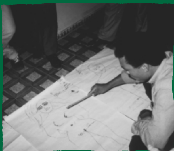
A participant at a workshop in Morocco feeding back from a body mapping exercise

Community mapping: People draw a map of their local community and mark important features, for example religious institutions, market places or schools. This is a non-threatening activity that can help people to discuss and analyse different topics that relate to HIV/AIDS.